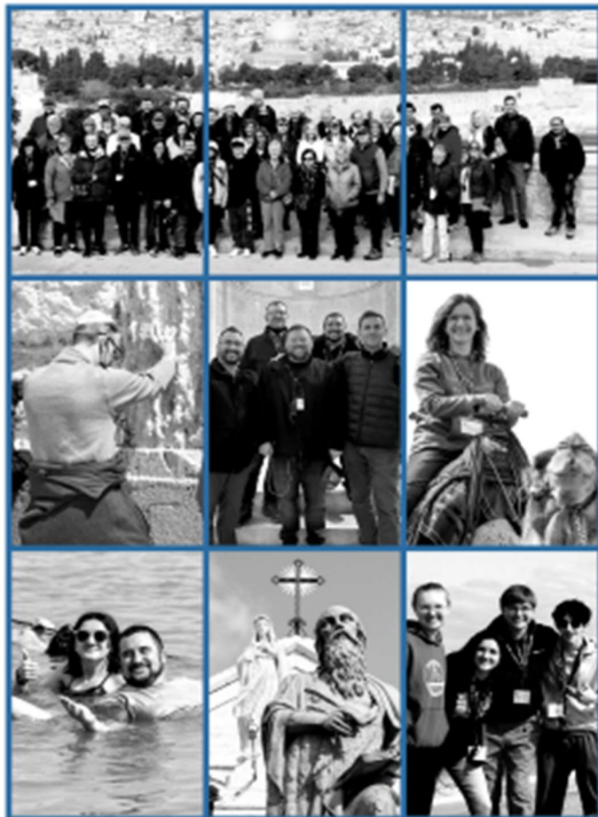
See Pictures from this trip at palphotos.smugmug.com/2022HolyLand